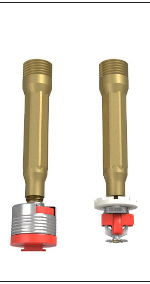
Model FSC-25U Pre-assembled

Ordering Information: (Also refer to the current Viking price list.)